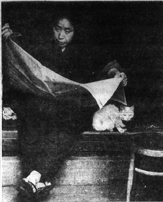
ON EXHIBITION through April 15 at Cranbrook Institute of Science, the above photograph is among 50 black and white and color photographs taken by the late Swiss photographer Werner Bischof. The picture, "Japanese Woman Reading a Newspaper", resulted from Bischof's two-year assignment in Japan for a Swiss picture magazine. The 37-year-old photographer had received world acclaim as a gifted technician and visual reporter when his death came after a 1947 accident in the Peruvian mountains.