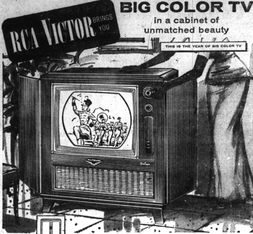
RCA Victor Cheltenham 21. Three speakers. Mahogany with special glazed doors or birch (Modern styling). Deluxe model 21CT663.