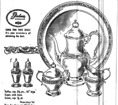
Table Appointments To Match Your Sterling Flatware!