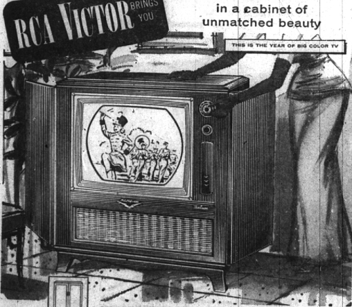
RCA Victor Cheltenham 21. Three speakers. Mahogany with special figured doors or birch (Modern styling). Deluxe model 21CT663.