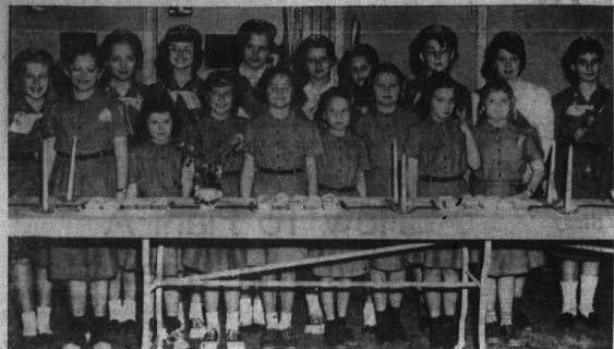
GIRL SCOUTS in the back row comprised the color guards and brownies of troop 386 at Quarton school acted as hostesses at the birthday tea. Individual cakes bearing the inscription of "44" were in observance of the founding of Girl Scouting.