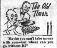
"Maybe you can't take money with you—but where can you go without it?"

La Porte, Ind.—Nine children, playing with a stray dog in a field near Rolling Prairie last May, were the recipients of shares in $587 in currency which the dog dug up in the field. The children turned the money over to the sheriff's office, and when it was not claimed, the sheriff divided it among the children.