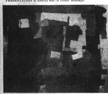
"CONSTRUCTION NO. 1"