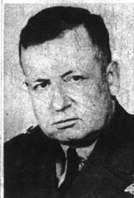
S. L. A. MARSHALL

As you rake the lawn this spring, be sure to collect roughage in baskets for your compost pile. You can mound it behind shrubs, if your property hasn't an appropriate location for a compost pile. If you sprinkle these baskets full of "stuff" with a little soil and then a decomposing agent, you will have