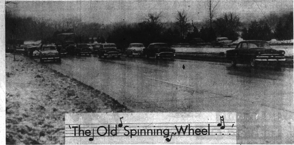
The Old Spinning Wheel