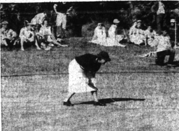
PATTY BERG takes a long, hard look at the shape of the green in order to sink a putt in the finals of the LPGA championship at Forest Lake country club. Patty lost out on the title when she failed to make a seven footer in the extra hole clincher.

Standings: W L Pct. White Sox 7 1 .875, Senators 6 3 .667, Orioles 2 7 .250, Yankees 11 2 1.000