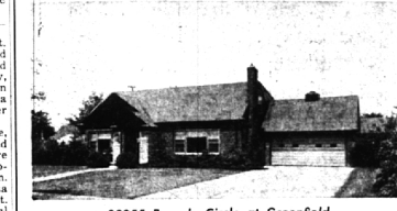
32055 Beverly Circle at Greenfield

Just right for the large family AND IN BEVERLY HILLS TOO! This very pleasant 1 1/2 story has 3 nice large bedrooms and bath up; also large walk in cedar closet, Library, Dining room and bath down; Large Living Room, full sized Bedroom room, Covered closed in porch, Full basement, 2 Recreation Rooms, 2 car Att. brick garage, Large space for laundry and furnace; Center hall, large dining space in Kitchen; plenty of cupboards; lot, is beautiful! 88 ft. front x 125 ft. at rear overlooking park area in choice Beverly Hills location, Near schools and transportation. Only $38,000 terms. Drive by and see it—then call Mr. Faber for appointment.