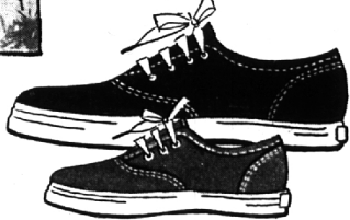
Use Your Charge-A-Plate®

P.F.'s . . . the perfect footwear for the active camper "Footure Foundation" shoe that keeps body weight properly balanced on the outside of the foot, supports and protects the arch. Washable canvas uppers with long-wearing rubber soles in red, blue, charcoal, pink with black.