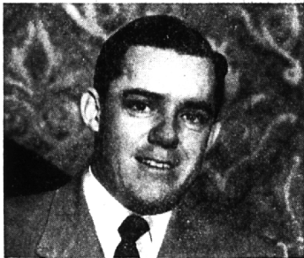
WILLIAM S. BROOMFIELD

"I pledge my future to the people of OAKLAND COUNTY"