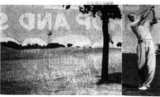
VIEW from the mid point (approximately 200-yards from tee) on the ninth hole fairway. Hollow lies directly ahead with green up slope in the distance. Leo Conroy, veteran pro, shows his form that gained the North Hill's course record.