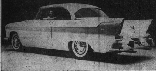
THE FURY , a gold and white two-door hardtop, is the newest model in Plymouth's 1956 line of cars. A band of anodized aluminum inlay in gold, tapering to a point near the headlights, gives bold emphasis to Plymouth's aerodynamic styling. The Fury has a high output V-8 engine.