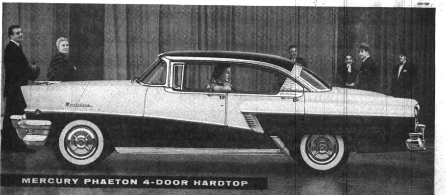
MERCURY PHAETON 4-DOOR HARDTOP

style, comfort, safety and power. Here are styling and engineering advances that will influence future Mercurys, just as features of the 1956 Mercurys evolved from yesterday's dream cars. See news in the making when you visit Mercury's display at the Auto Show.