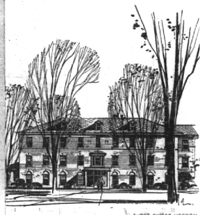
THREE RIVERS HOSPITAL

Hospital administrator Erickson sees examples daily of patients who have inadequate hospitalization coverage. "Because Blue Cross benefits are service benefits—with no dollar limits—they always keep abreast of the times," he says.