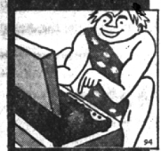
MI 4-1507 534 S. Woodward