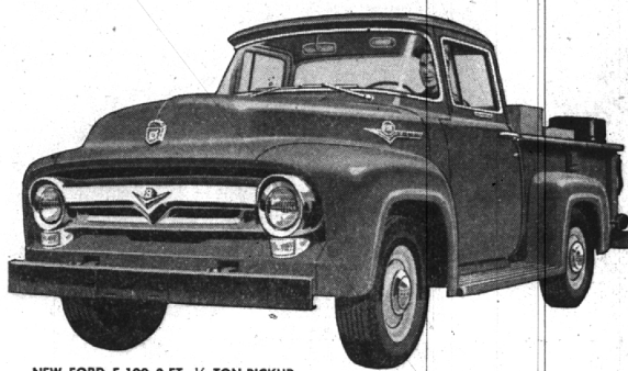
NEW FORD F-100 8-FT. 1/2-TON PICKUP, GVW 5,000 lbs. Choice of 133-h.p. Six or 167-h.p. V-8.