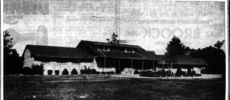
IN BLOOMFIELD HILLS

A lovely, new, contemporary home on a 23/4 acre hilltop in Bloomfield Hills. Just note these features: