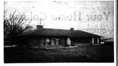
BLOOMFIELD (NEAR KIRK)

This is a tidy 3 bedroom home . . . set upon a pleasant corner site . . . in the heart of a splendid, friendly neighborhood. $19,400.