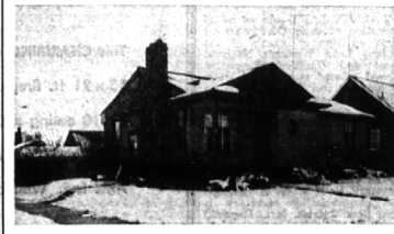
COMBINATION OF INTERESTING FEATURES

If you are interested in a fine home on a picturesque site you should see this home.