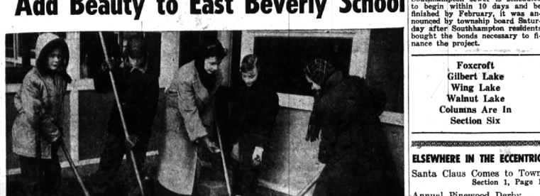
Tulip Plantings by WNFG Club Will Add Beauty to East Beverly School