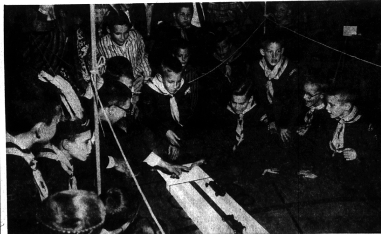
MAURI ROSE, three-time winner at Indianapolis' 500 Mile Memorial Day classic, points to the winner in