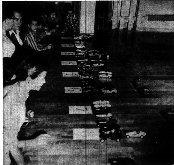
FAVORITES in the pre-race lineup are picked out by those who came to see the big runoff.