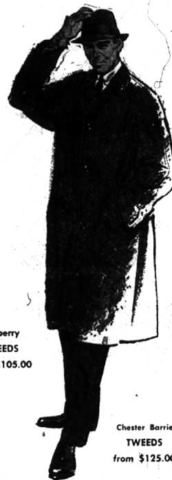
Chester Barrie TWEEDS from $125.00