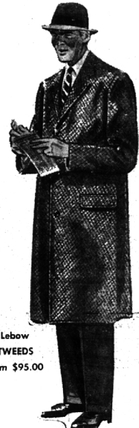
Lebow TWEEDS from $95.00