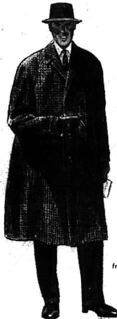
Burberry TWEEDS from $105.00

You will find many bargains in The Eccentric Classified Columns.