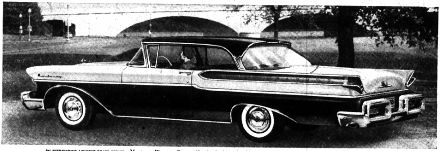
IN MERCURY'S LOWEST PRICE SERIES...Montrey Phaeton Coupe. Also in the big-value Montrey series: Phaeton Sedan, 2-door Sedan, 4-door Sedan.

Don't guess Mercury's price by the new size and luxury (never before has so much bigness and luxury cost so little)