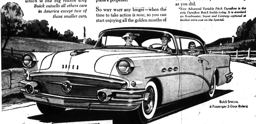
Buick SPECIAL 6-Passenger 2-Door Riviera

AIRCONDITIONING at a COOL NEW LOW PRICE It cools, filters, dehumidifies. Get a Season Comforter in your new Buick with genuine FRIGIDAIRE CONDITIONING