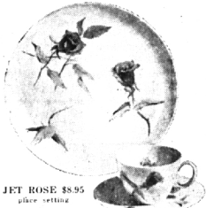
JET ROSE $8.95 plate setting