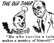
"He who carries a tale makes a monkey of himself!"

"White House Script" was designed for Mr. Eisenhower, the first lady of the land... recently released it for public use, and Able Sales has the first such machine