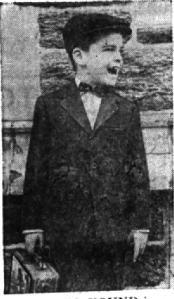
SCHOOL BOUND in a washable, reversible jacket in combed shen galdurine. "Zelanzied" on the featured side to resist rain and stains; reverses to 100% nylon fleece.