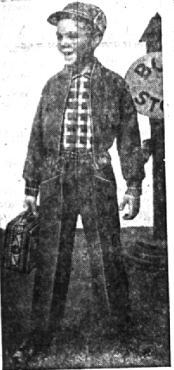
WELL ON HIS WAY to a bright scholastic career is this beginner in his corduroy coordinated jacket, slacks, cap and shirt. A smart looking outfit by Kaynee.

To Protect Books Good protective coverings for school books and notebooks can be made of clear or colorful plastic yardsticks. Wiping with a damp cloth removes dirt.