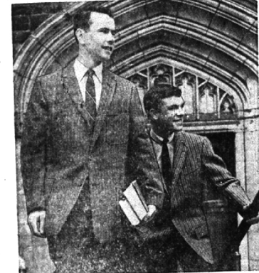
COLLEGE CAMPUS FASHION NEWS will be made this fall by natural look jackets plus Ivy League stripes. At left: herringbone-pattern jacket with stripe effect in brown and smoke blue, tailored in knitted worsted jersey. At right: lightweight wool worsted jacket in vertical stripes of brown, beige and olive green.