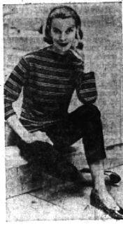
FOR AFTER-CLASS relaxing, washable, striped slip-on can be paired with matador pants or worn with Bermuda shorts.

Big news on the campus is the car coat, in a variety of fabrics, from wool to warm-lined rayon. A full-length camelhair coat and