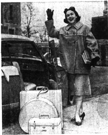
SHE'S PACKED AND READY to leave for college, and her good buys include light, strong luggage with special packing bars and elasticized curtains, and an alpaca-lined, camel hair-wool car coat with leather buttons.

Hats and Scarves Of the shopping list—and in the luggage—will go at least one hat for special occasions and many long wool scarves to serve as casual headgear in cold weather. And the college girl can pick and choose from a wide array of accessories, those inexpensive extras that add much to the variety and versatility of her wardrobe.