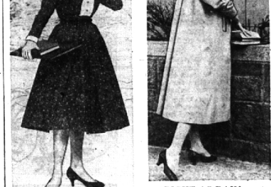
PRINT MAKES school news in skirt and top with ruffled bib front, cuffs for dress-up look. RIGHT-AS-RAIN coat with matching hat, pleated back, goes smartly to school in any weather.