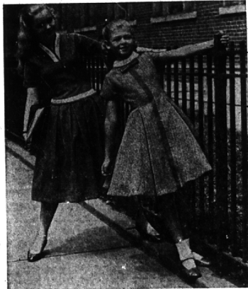
SISTERS SHARE THE FUN of going to school in style. Big sister, off to junior high, takes pride in her trim-looking flannel dress, and looks with approval at little sister, returning to grade school in tweedy princess dress.

Shop with a plan, and you'll find your child's back-to-school wardrobe will show the happy results. Make a list of the items that will be needed, not forgetting that your child will require dress-up clothes as well as school clothes.