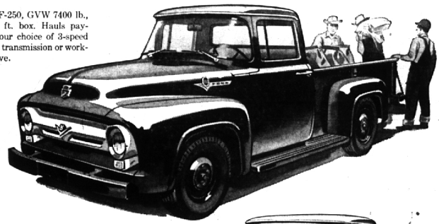
Husky 8-footer. Ford F-250, GVW 7400 lb., features roomy 65-cu. ft. box. Hauls payloads up to 3535 lb. Your choice of 3-speed or 4-speed conventional transmission or work-saving Fordomatic Drive.