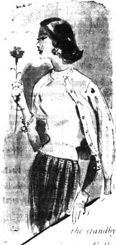
the standby in your College Wardrobe