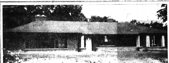
4681 McEWEN, BLOOMFIELD HILLS

Midwest 6-1600 — 4080 W. Maple — Birmingham