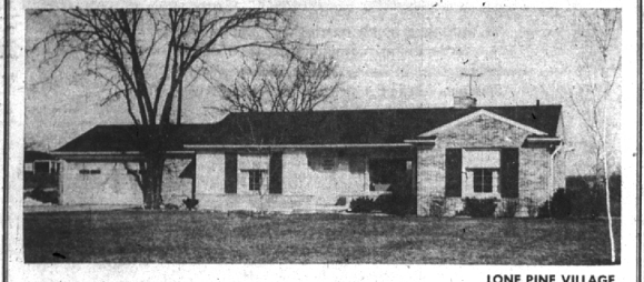
Set on over a half acre of beautifully landscaped grounds in the rolling country side of Bloomfield Township.

Really a complete home with carpeting in every room, aluminum storms and screens, two and a half car attached garage and a screened and glassed porch.