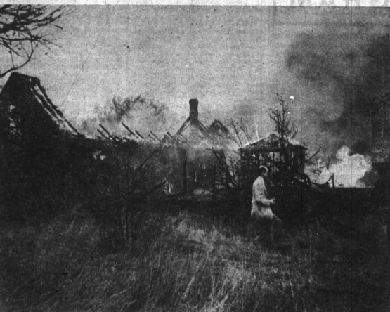
FIRE DESTROYED THREE BARNS on the old Mercer farm on Maple road east of Lahser last week when burning debris from trash barrels ignited one of the outbuildings...