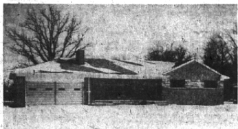
31964 MAYFAIR LANE

Directions: Beverly Hills No. 12—2 Blocks West of Southfield on Beverly Road (1 1/2 Miles)