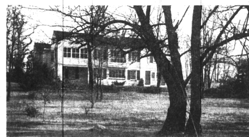
On Wing Lake

This "New England" Two-Level Country Colonial—is fascinating in every respect. Its magnificent setting has beautiful, mature trees. Full advantage is taken of the natural sloping terrain of this gorgeous 100-foot lake-front site.