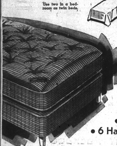
Use two in a bedroom as twin beds.