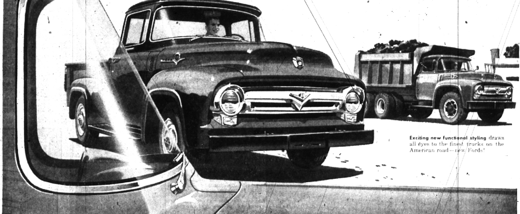
Exciting new functional styling draws all eyes to the finest trucks on the American road—Ford's!