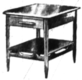
• End Table $55.00