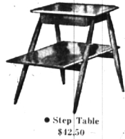
• Step Table $42.50