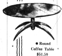
• Round Coffee Table $51.50