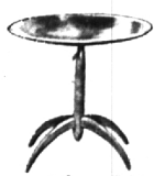
• Lamp Table $37.50