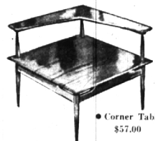
• Corner Table $57.00