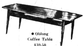
• Oblong Coffee Table $39.50