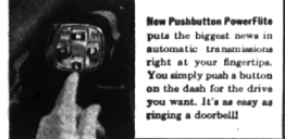
New Pushbutton PowerFite puts the biggest news in automatic transmissions right at your fingertips. You simply push a button on the dash for the drive you want. It's as easy as ringing a doorbell!

Two more fabulous Chrysler "firsts"* ● Highway Hi-Fi record player. Enjoy your favorite music while you drive. ● New Instant airplane-type heating system. From zero to room temperature in a matter of seconds. *Optional equipment