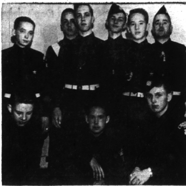
BEING USHERS at Saturday's football game gave these Birmingham Explorer Scouts the chance to see a University of Michigan team defeat Northwestern university in their annual gridiron battle. The eight Explorers represent the largest contingent ever to go from Birmingham to serve as ushers in U-M's stadium.