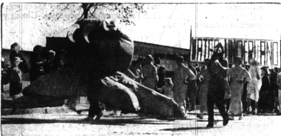
FRESHMEN , their octopus and class decorations may have been green as far as the parade went, but there was nothing green about the cleverness of their idea nor the tempo of their marching. The high-school newcomers have every right to be proud of the appearance and achievement.