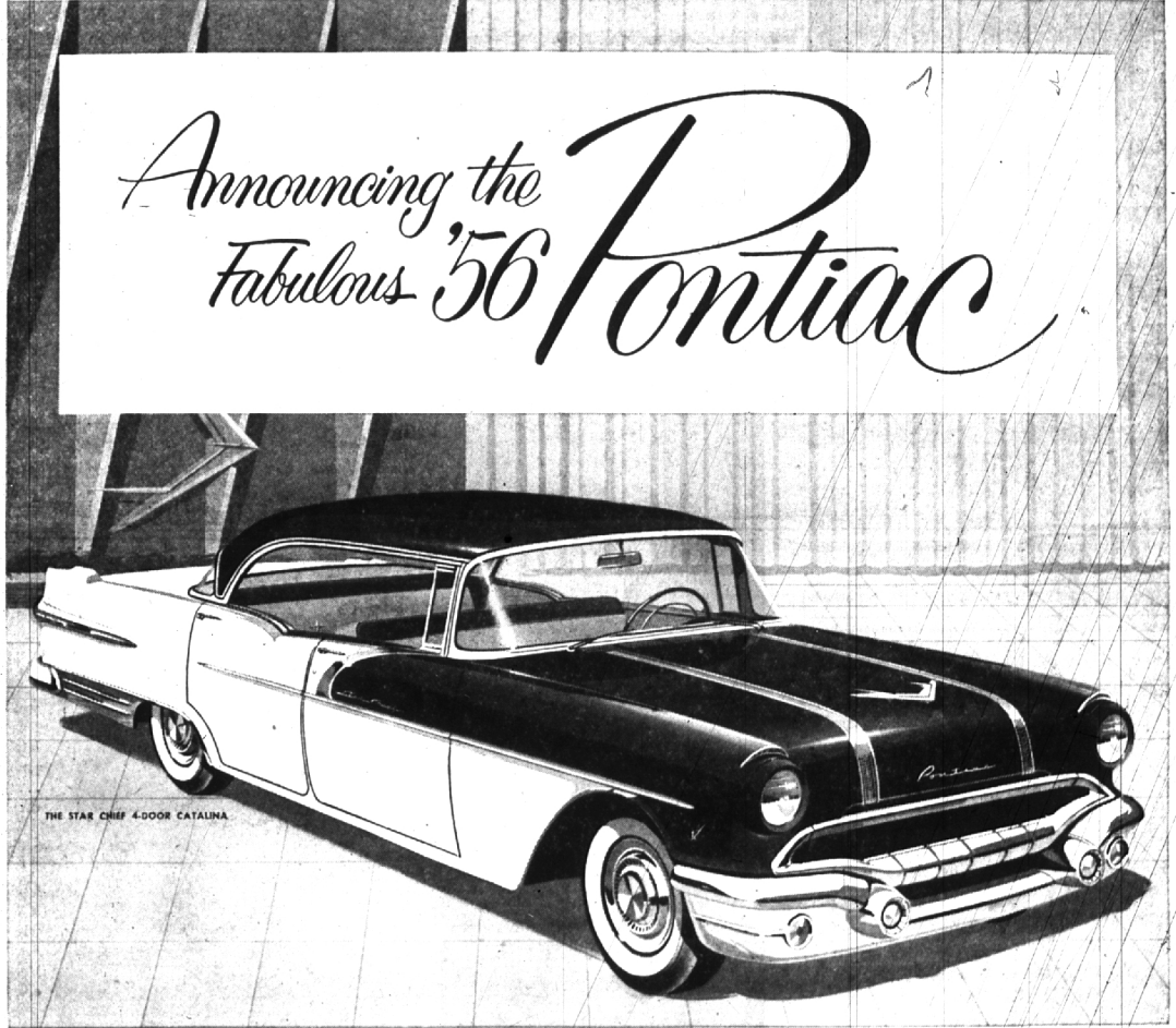
THE STAR CHIEF 4-DOOR CATALINA

Introducing A BIG AND VITAL GENERAL MOTORS "AUTOMOTIVE FIRST"!