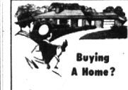
Buying A Home?

Why Take a Chance? Responsible home builders belong to the Builders Association. They live up to the highest ethical standards — use only quality materials and workmanship to maintain their membership — guarantee your down payment with $100,000 bond. Why take a chance with a non-member builder?