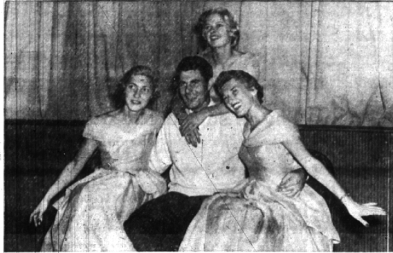
THREE GIRLS and a man always make an interesting dance combination. While no detailed description is forthcoming from Follies directors, they nevertheless include this number among their "top performances" selection.