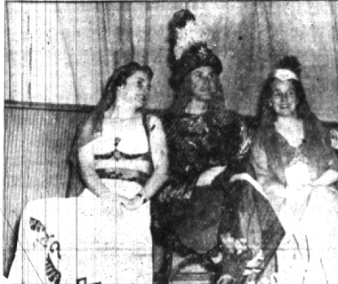
ARABIAN dancers will provide a glimpse of what the old Ziegfeld Follies were like, even to portraying the slave girl and one of the favored from the harem.