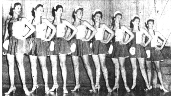
YOU CAN'T have a true Follies without a chorus line, so these League members have spent hours learning rhythm dancing which has already been likened to the famous "Rockettes" of New York City fame.