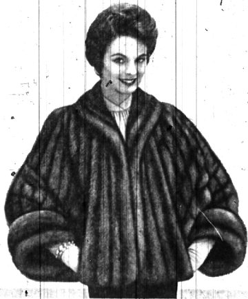
Natural Wild Mink Cape Jackets