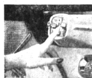
The Magic Touch of Tomorrow

New '56 Dodge invades the low-price field with the only full-styled, full-backed KING SIZE CAR . . . in a full choice of body styles.