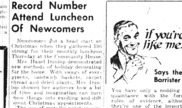
if you're like me... Says the Barister

Many From Here Visit Tawases One car in every 13 visiting the Tawases during the past week's breaking summer tourist season came from the Birmingham-Pontiac area, according to figures recently made by the Tawases chamber of commerce.