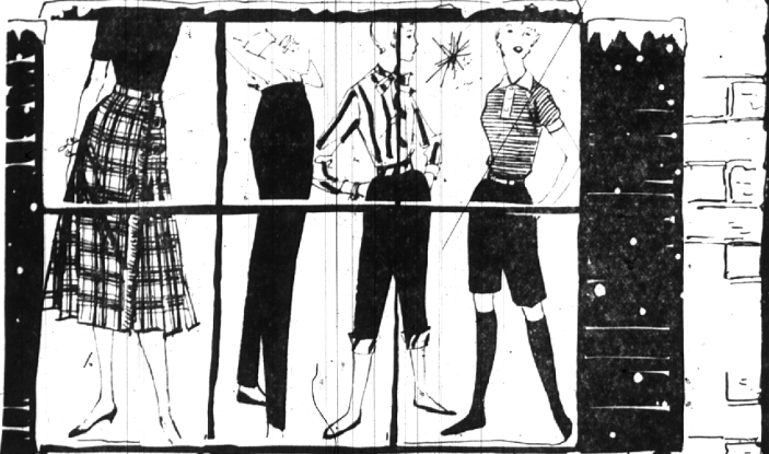
Fringed skirt length plaid knit with giant safety pin. 100% wool, asst. tartans. 17.95