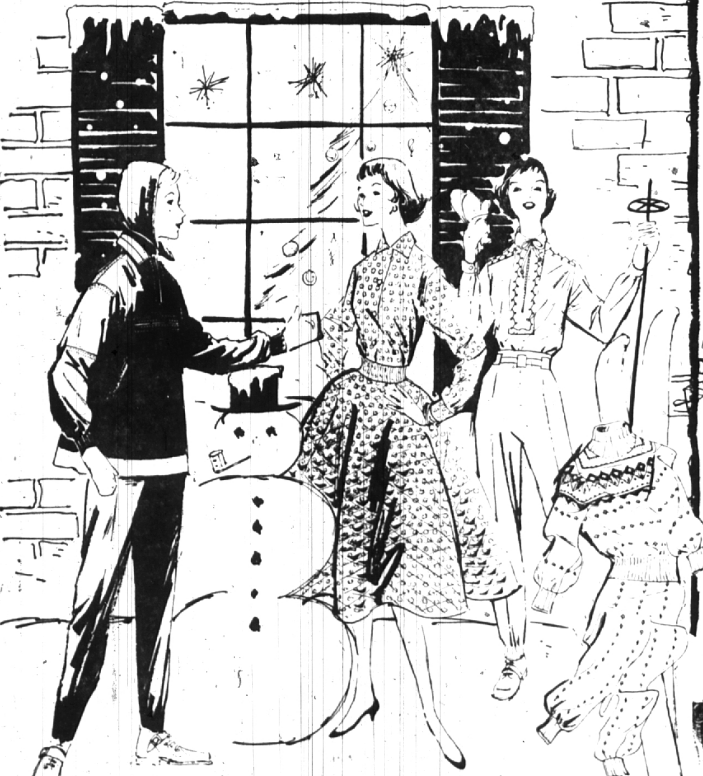
Parka with hidden hood. Stripes on navy or red nylon. 17.95. P.O.W. slim fitting water repellent gabardine pants. Navy, black. 22-30 waist, reg. short long. 16.95 and 22.95