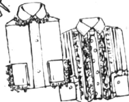
Left: Blouse with tatted lace trim. White, pink, blue, yellow. 30-36, 5.95. Right: Matching shirt. Glitters gingham tie. White. Sizes 30-36, 1.95