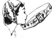
Swiss embroidered belt, matching fast cap. Red, royal, white. Cap, 5.95; belt, 3.95