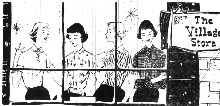
Personalized monogram blouse, Peter Pan collar. 10111114, white crepe. 10-18, 8.95