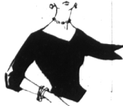
Pie-cut velveteen blouse with 3/4 length sleeves. Black, brown. Sizes 10-16, 10.95