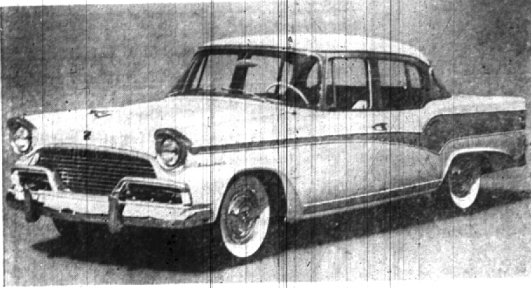
READY FOR ITS Nov. 22nd Birmingham debut is this Studebaker "President Classic", a 4-door sedan with 210-hp engine and new styling. The President line also includes 11 other models. The cars are scheduled for local showing next Tuesday at Carkner's, 666 S. Woodward.